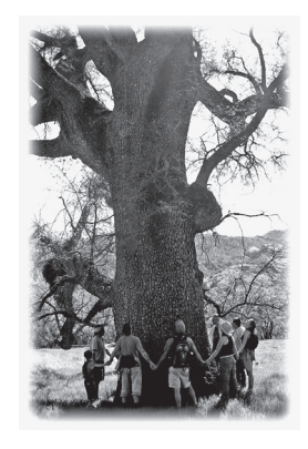
Roots of Herbalism Spring Camping Trip

Mailing address: PO Box 39, Forestville, CA 95436 Physical address: 9309 Highway 116, Forestville